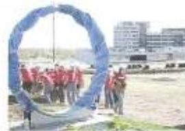
A stainless steel ring, which like a blue "Miracle of the Human Spirit" bracelet, is part of the volunteer tribute garden in Cunningham Park

Several recent sports events have raised money to aid the Joplin recovery effort. Joplin HS played a football game at Arrowhead Stadium in KC, vs Raymore-Peculiar HS. Over $100,000 was raised, as the KC Chiefs donated all revenues from the game. The University of Missouri basketball team played their first exhibition game with Missouri Southern State University, of Joplin. Revenues of over $100,000 were raised from the event, and donated to the relief effort. Ty Pennington of Xtreme Home Makeover, with ABC television also completed a project for Joplin. Not only did the show construct 7 new homes, but re-built a park. Habitat for Humanity of Joplin and Tulsa is also building housing in Joplin. Several corporations, doing business in Joplin and the southwest Missouri area, have donated $1,000,000 each. Many relief funds have been set up for donations. A quick Google search can show which organizations benefit particular areas of the rebuilding effort.